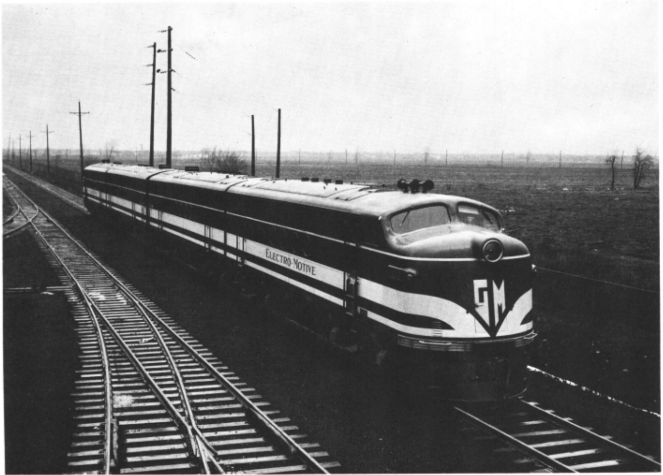
No. 103, fresh from the assembly line and paint shop at Electro-Motive's La Grange plant in 1939.