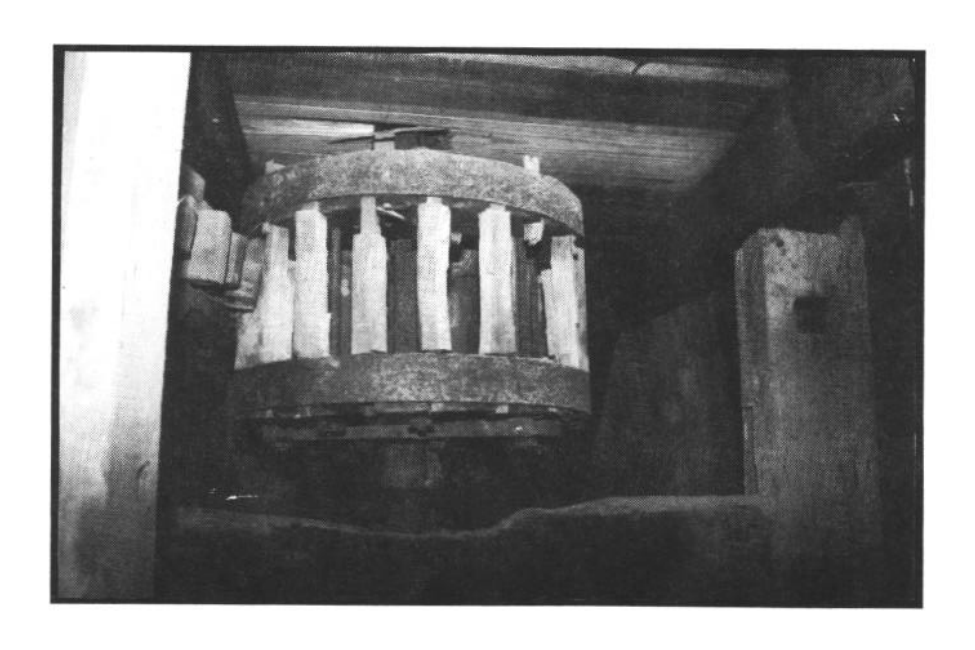
Grindstone Driving Shaft