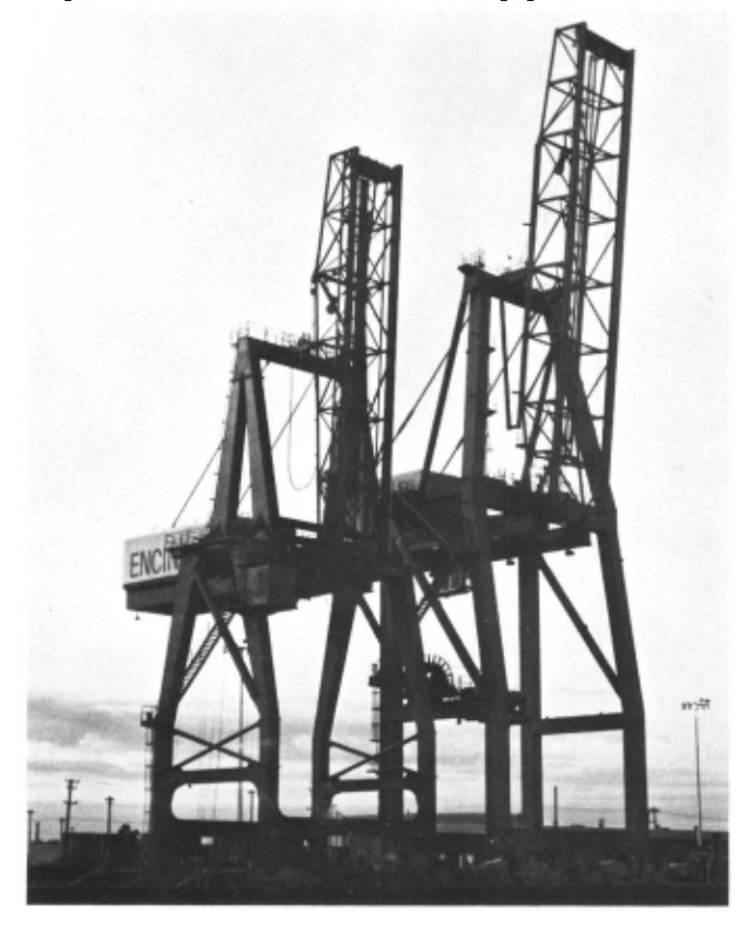
1959 and 1981 vintage PACECO container cranes as they appear today at Encinal Terminals.

The success of containerization and the PACECO Container Crane not only accelerated the shipment of goods but created a demand for a different breed of ship and container terminals. To keep pace with this