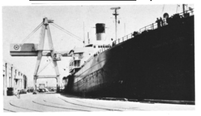
The Hawaiian Citizen, the world's first dedicated containership being serviced at Encinal Terminals during the early 60s.

By the end of 1980, there were at least 737 ship-toshore container-handling cranes of the PACECO type operating in over 200 ports around the world. Of the 737 cranes listed, 283 (38%) were PACECO Portainer cranes. (Containerisation International, September 1981)