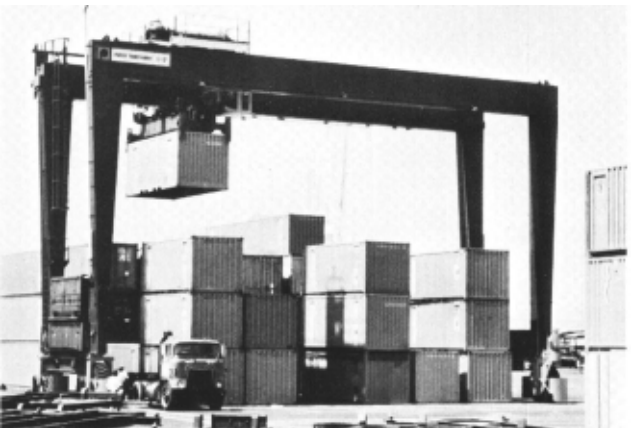
PACECO MACH Transtainer systems for handling containers in the yard.

Today, Encinal has a highly competitive operation providing a complete range of shipping services fully computerized for handling containers, general cargo, non-petroleum liquids with warehouse and distribution facilities.